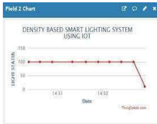
Fig 3.1 Output Chart Obtained in Thingspeak

Each of the dots corresponds to the value and the time at which the value was posted to the channel. Place the mouse over a dot to get more details on the exact date and the GMT offset from which the value was posted.