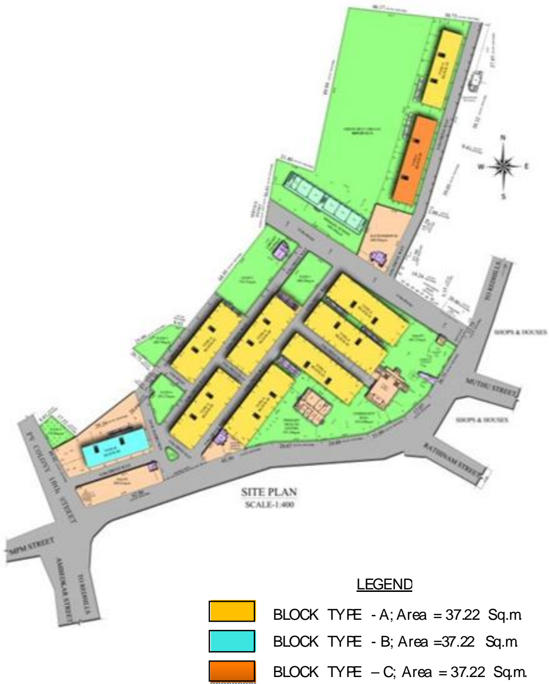
Fig 3: Site Plan of Moorthingar Street, Vyasarpadi