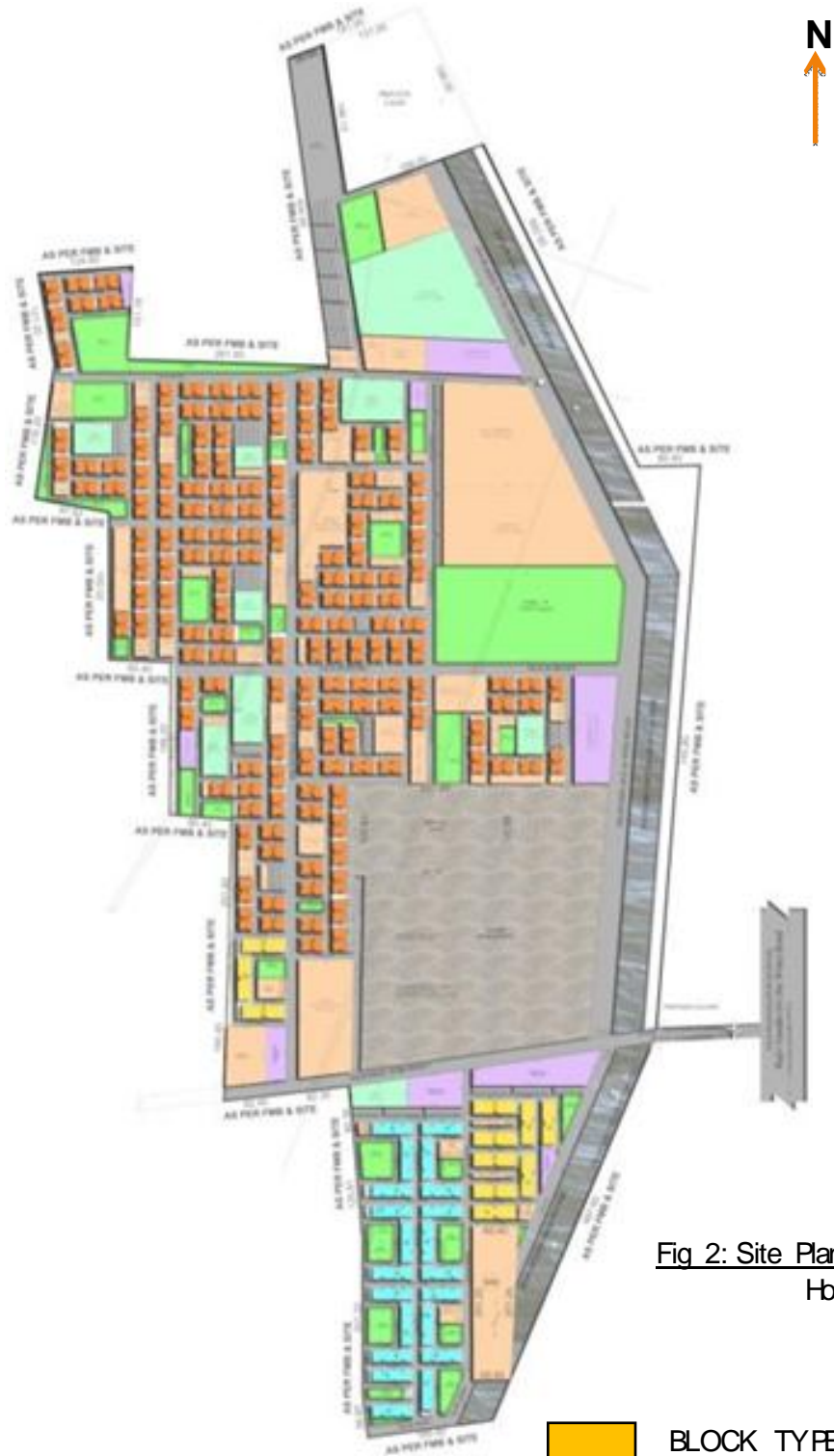
Fig 2: Site Plan of Perumbakkam Slum Housing Project